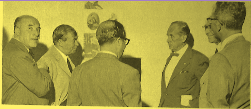
ARCHITECTURAL JURY included (left to right) Ernesto Rogers, Alvar Aalto, Gropius and (center, back to camera) José Luis Sert. Half hidden but facing camera at far right: Francisco Matarazzo Sobrinho, founder of the São Paulo Museum of Modern Art and "genie" of the Biennial

THE SECOND BIENNIAL INTERNATIONAL Exhibition of Modern Art of the Museum of Modern Art of São Paulo December 12–February 28 was the opening event of São Paulo's year-long celebration of its 400th birthday. All the world's architects were eligible to submit work to the screening committee for the architectural section; the works of 129 architects or architectural firms from 19 different countries were chosen for the exposition: they included works of 44 American offices — Wright, Mies, Sa-